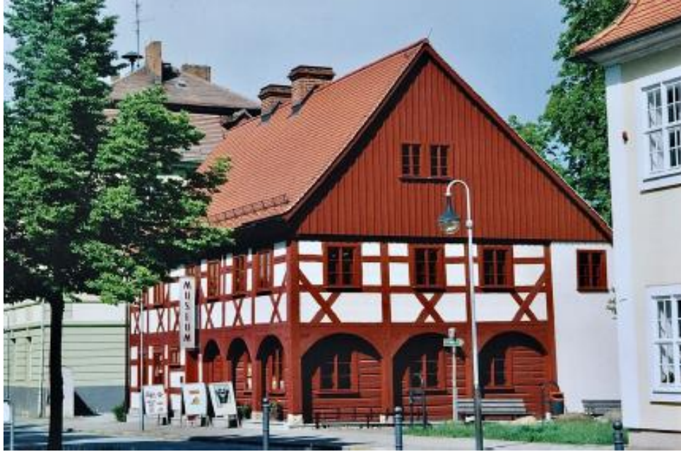
Raschke's House – Oldest building in Niesky